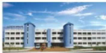
JAGANNATH VIDYALAYA CBSE SCHOOL