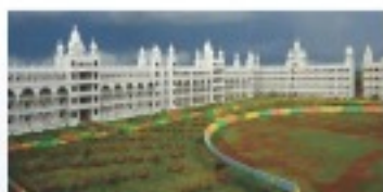
SSN ENG. COLLEGE