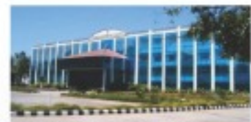
TAGORE ENG. COLLEGE