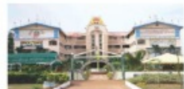
SUSHIL HARI INTERNATIONAL SCHOOL