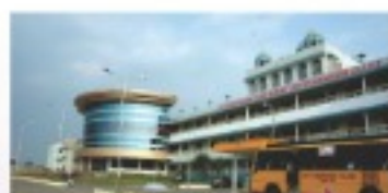
VINAYAGA MISSION UNIVERSITY