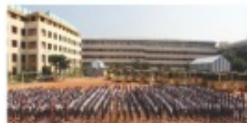
VELAMMAL VIDHYASHRAM CBSE