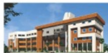
PROFESSOR DHANAPALAN ENG. COLLEGE